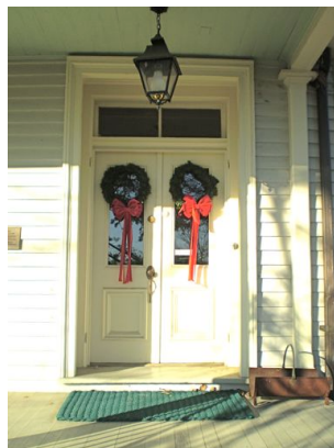
Deck the Halls!