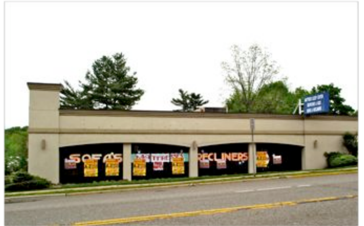
This is same location today. At the present time the building is vacant.