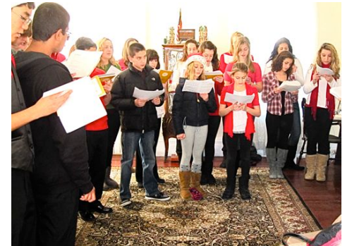
The joyful sound of youthful voices!