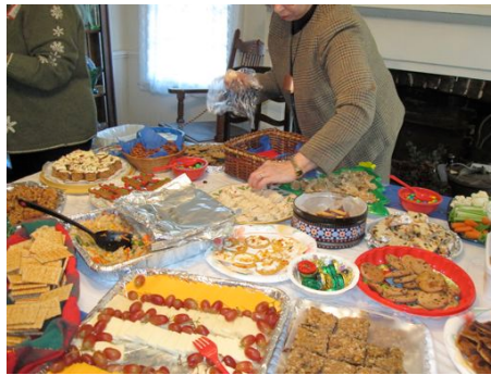
See anything that you like?