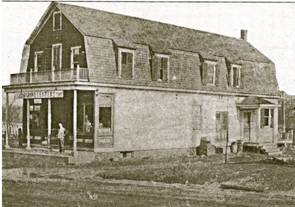
Cedar Grove's third post office shown here after 1910 when the store had been sold and the post office moved to a new location.

Cedar Grove's second post office, which was discussed in our previous newsletter, was located at the corner of what is now Pompton Avenue and Little Falls Road. The building that housed both the post office and Edwin E. Taylor's store was destroyed by fire in the late 1890s and its replacement was built on the same spot.