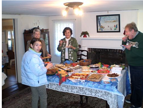
Wonderful things to eat!