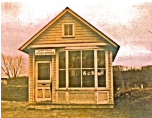
This former butcher shop became Cedar Grove's fourth post office. The building was used as a post office from 1907 to 1913.

When this store was later sold it became Cedar Grove Center Store and the post office was moved to a small building adjacent to the store. This building had been erected in 1900 by a Mr. Decker as a butcher shop and had originally been located in what is today the center of Cedar Grove where Bank of America is now located. When the butcher shop was sold it was put on a flat wagon and pulled by six horses down Pompton Avenue to Bowden Road and then to Little Falls Road up to Pompton Avenue, a distance of over a mile.