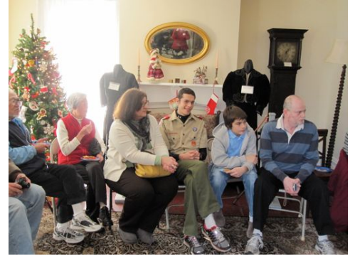
Enjoying the concert