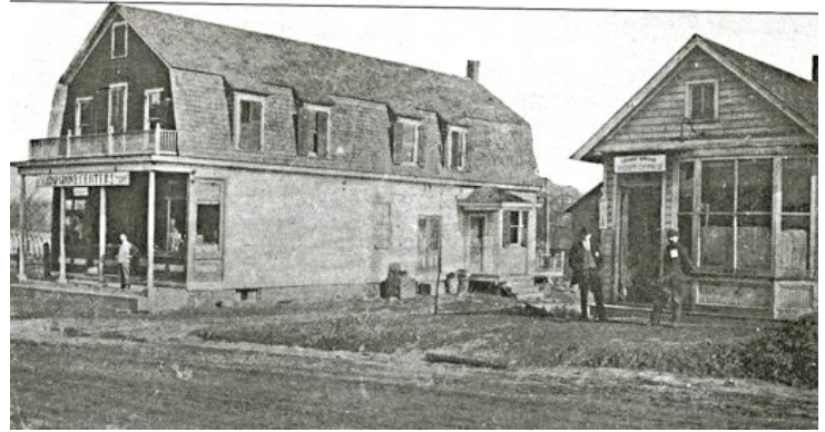
The third and fourth locations of the post office. The building on the left is where the third post office was located and then moved to the building on the right.