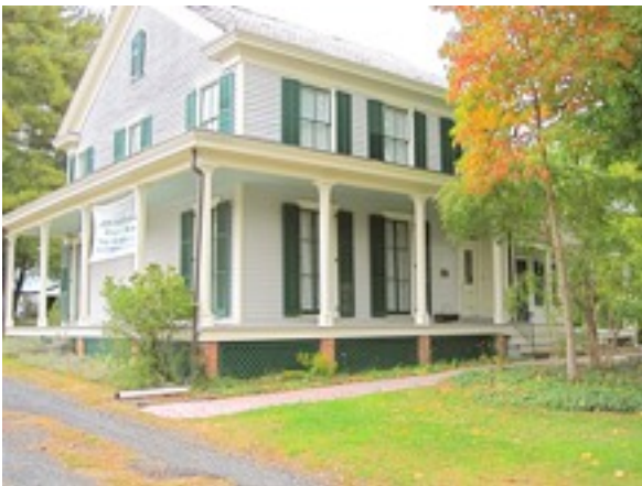
The Morgan Museum as it appears today.