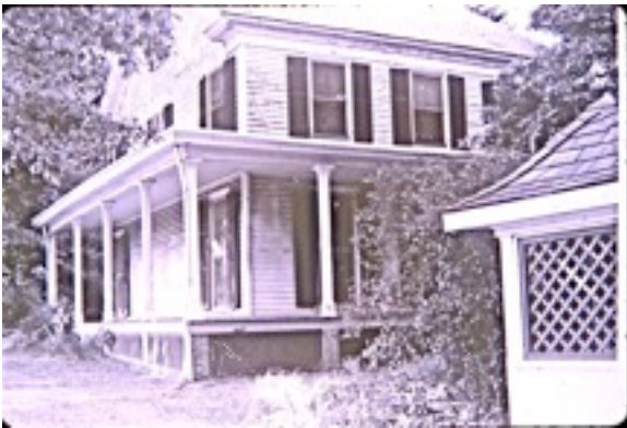
The house in 1985 before it became the Morgan Museum.